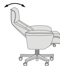
Manual angle adjustable headrest