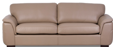
3 SEAT DUO